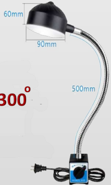
Work Lamp w/magnetic base