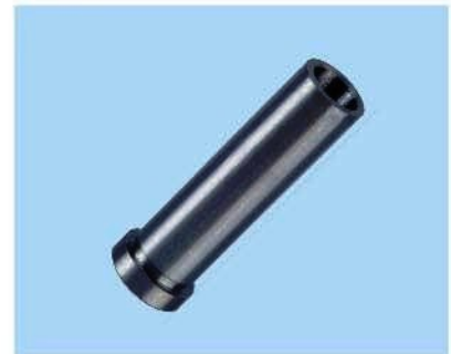
M SCM415 H HRC45°~